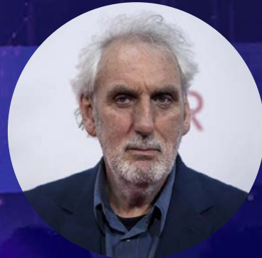
Daniel Radcliffe Actor BUFTA supporter

"It gives me great pleasure to be the inaugural Patron of BUFTA, Bond University's Film and Television Awards. The competition is an incredible opportunity for you, the next generation of young filmmakers, to show the world who you are and what you can do. I'm looking forward to seeing all your stories."